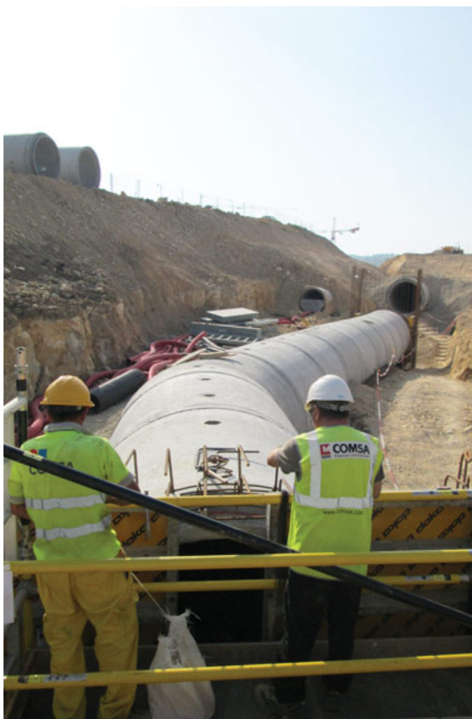
The precipitation drainage system, located underneath the galleries, is implemented prior to galleries works

The awarded contract involves the construction of 12 reinforced concrete galleries which host Safety Important Component (SIC) related systems such as cooling water pipes and power supply cables of the networks that need to be visited and maintained during the lifecycle of the ITER machine. The total length of galleries will measure 650 metres, with particular sections measuring an impressive 12 metres in width and 6 metres in height. In total, 10,000m 3 of earth is being moved in excavation (earthworks) and 5,000 m 3 of concrete is being used. The awarded contract also comprises the precipitation drainage, i.e. the water collected from on and around the Tokamak and Assembly buildings, where in total the length for rain water drainage involves 800 metres of gravity pipework with diameters ranging from 400 millimetres to 1,400 millimetres.