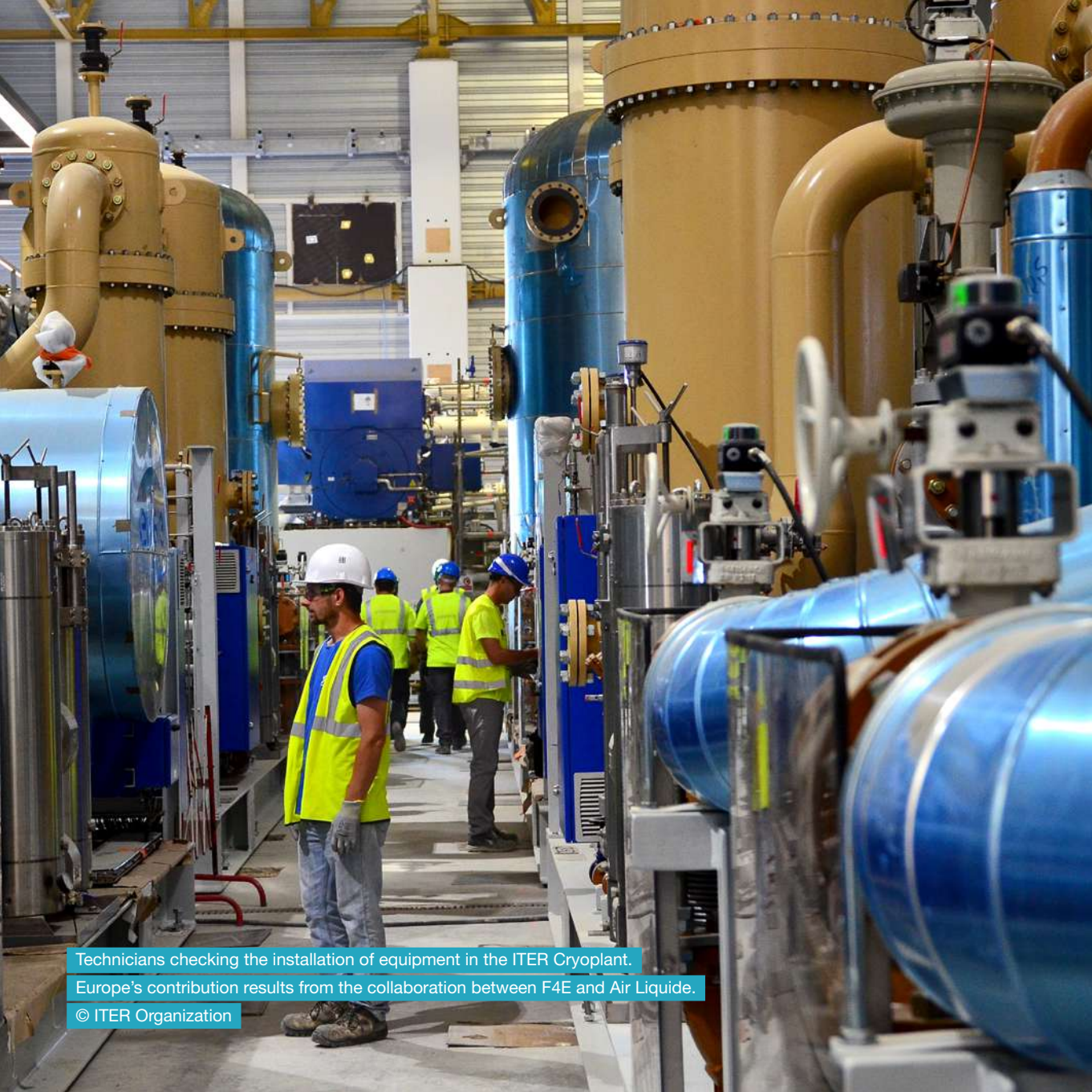
Technicians checking the installation of equipment in the ITER Cryoplant.