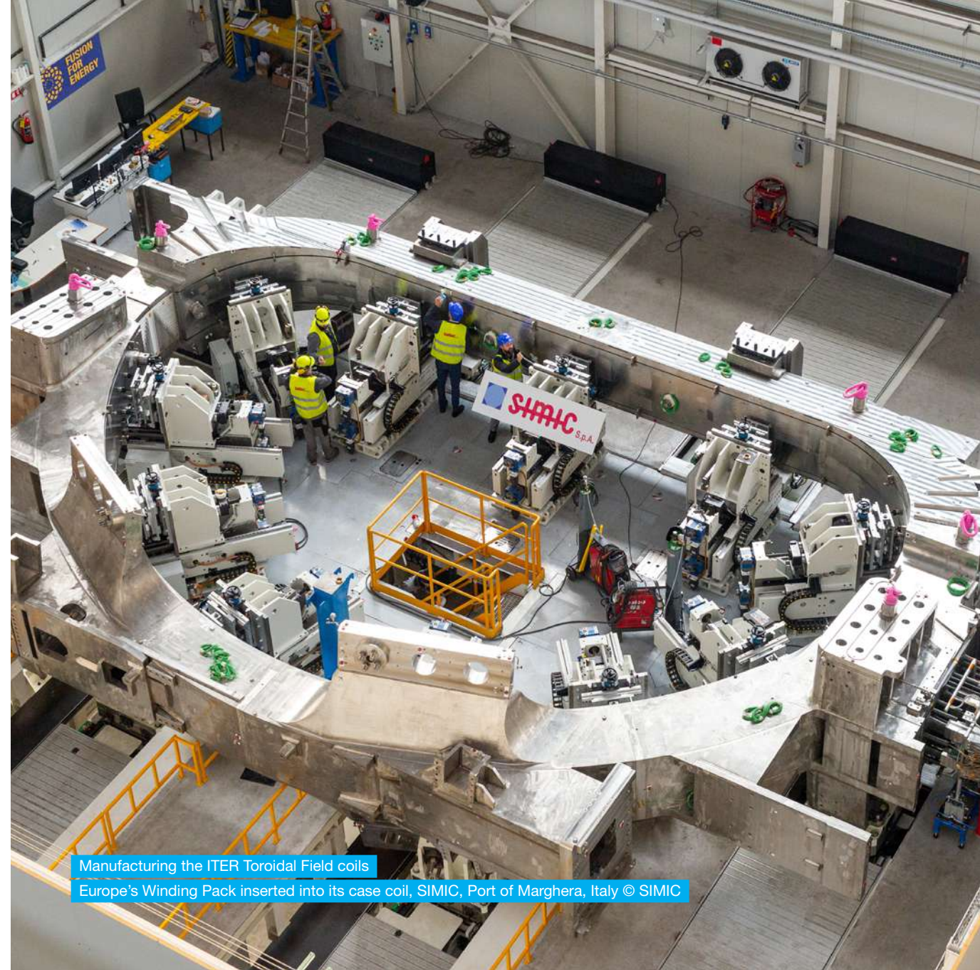
Manufacturing the ITER Toroidal Field coils Europe's Winding Pack inserted into its case coil, SIMIC, Port of Marghera, Italy

“ The superconducting technology which has been developed in the ITER project has led to a number of innovative systems in the fields of medicine and energy. ”