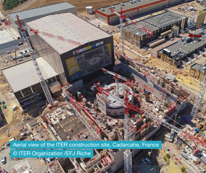
Aerial view of the ITER construction site, Cadarache, France