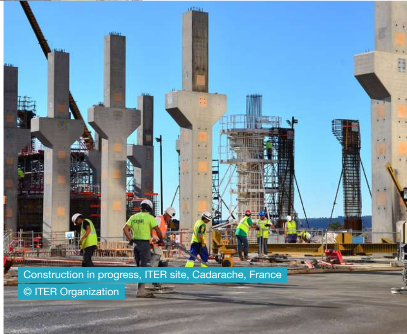
Construction in progress, ITER site, Cadarache, France

“ ITER is one of these projects that really excites the imagination of scientists and engineers. ”