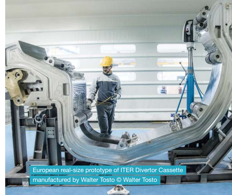
European real-size prototype of ITER Divertor Cassette manufactured by Walter Tosto

“ ITER has given us the incentive to invest in an energy market, at research stage, which is somehow pushing us towards innovation and technical excellence. ”