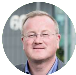
Greg Willets Wood Plc.

“It is a project that pushes innovation all the way into the future. It is important to be able to apply our research findings into real projects like ITER – a machine that will demonstrate that fusion is not a dream but a reality.”