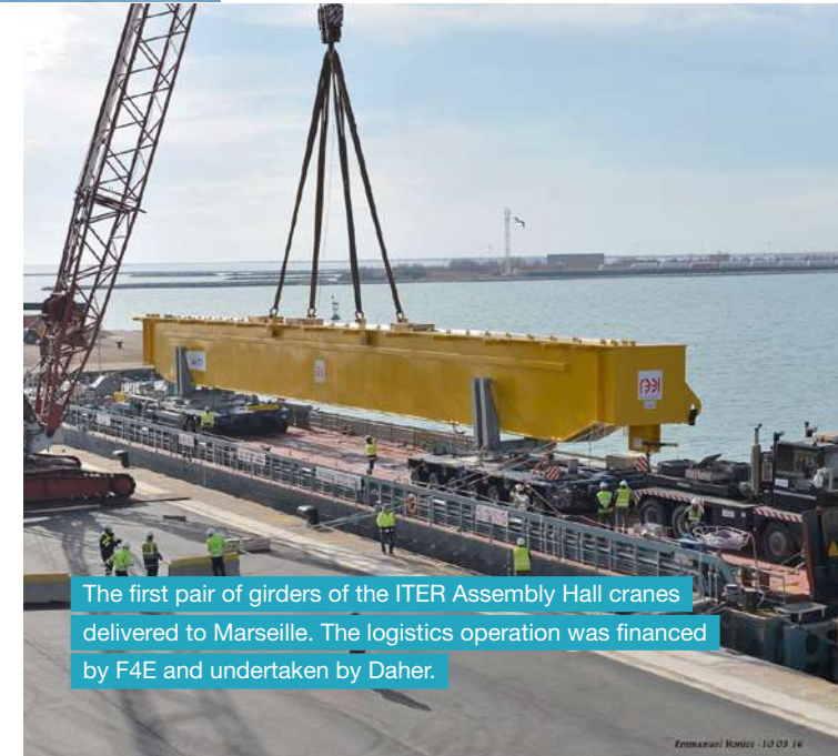
The first pair of girders of the ITER Assembly Hall cranes delivered to Marseille. The logistics operation was financed by F4E and undertaken by Daher.

“ For a mega project such as ITER, innovation is key for its success. Since the beginning of the project, Daher has invested in developing new tools such as a specific control room, artificial intelligence and an e-Roadbook. All applications will be used in future logistics operations. ”